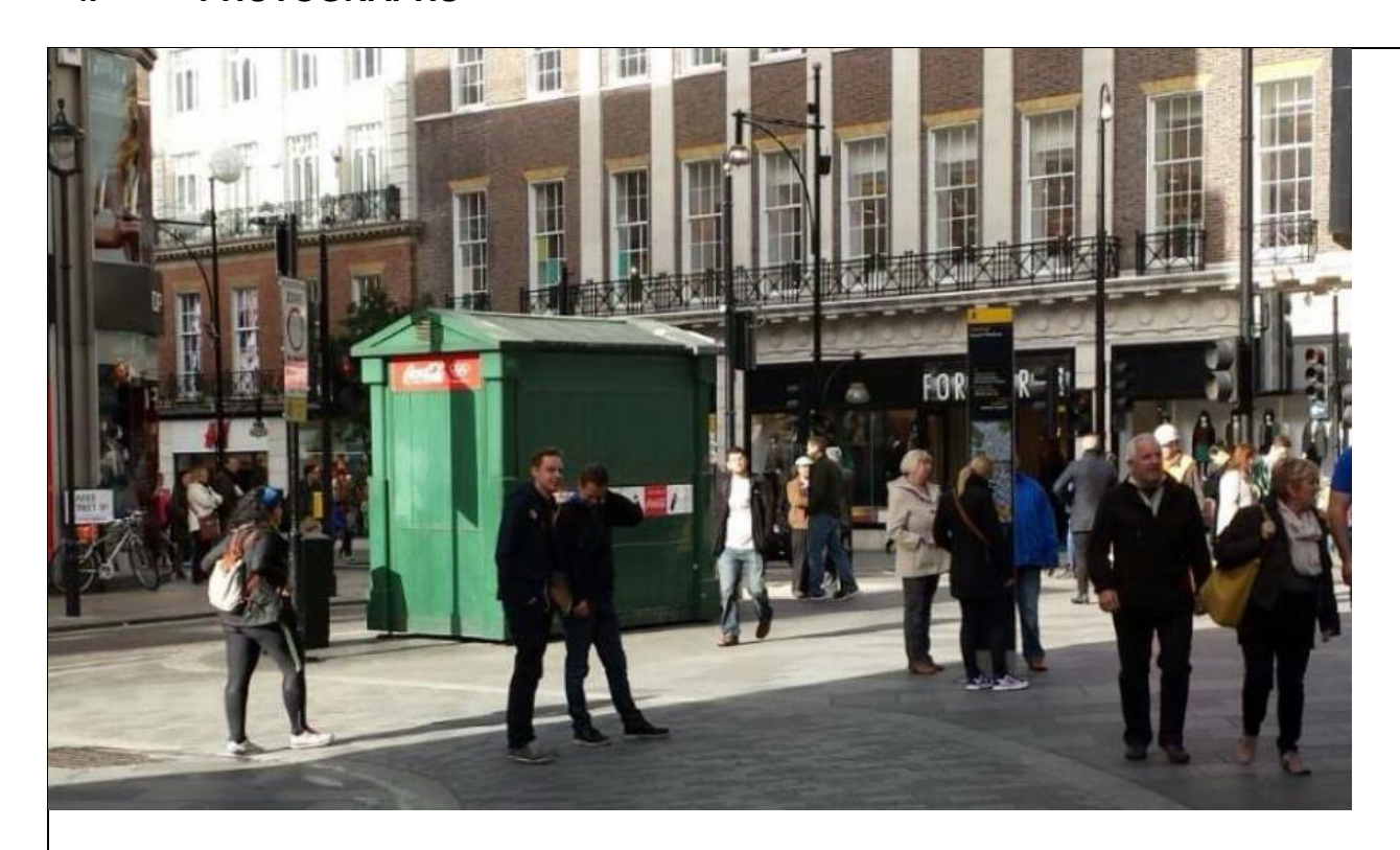
Views from South Molton Street